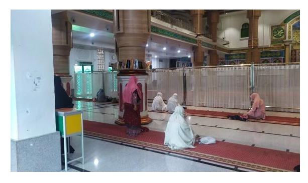
Figure 9. Women's prayer room.