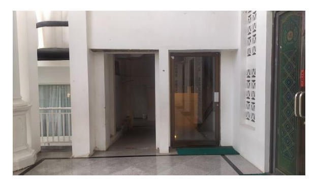
Figure 7. The entrance that is connected to the toilet and the place for women's ablution leads to the women's prayer room.